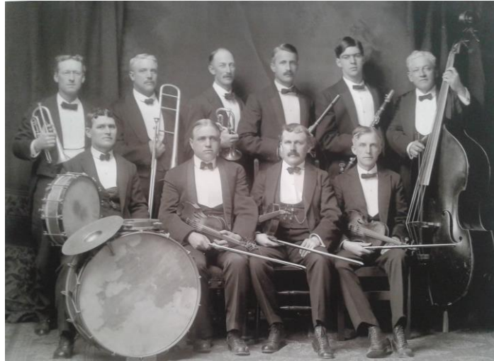
The Wahnetah Orchestra

The sharp looking group of men pictured above, the Wahnetah Orchestra, was perhaps Hillsborough's most popular musical group for over thirty years. Organized in 1889, it featured some of Hillsborough's most skilled musicians and prominent citizens. In addition to playing at various shows and dances in Hillsborough, the orchestra played for every Hillsborough High School graduation from 1890 through the 1920s. The group played in virtually every town in southern New Hampshire including shows in 1897 and 1898 at Lake Sunapee on the steamship "Winona". The photograph dates from around the turn of the 20 th century and shows its members at that time. A classy looking bunch indeed!